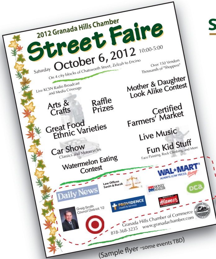
(Sample flyer -some events TBD)